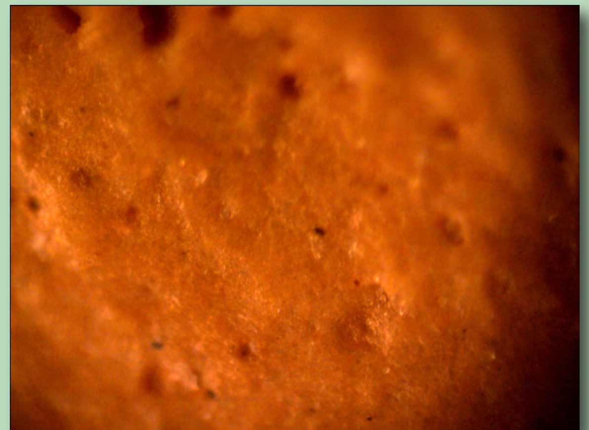
Negative presence of a microtrace (150x)