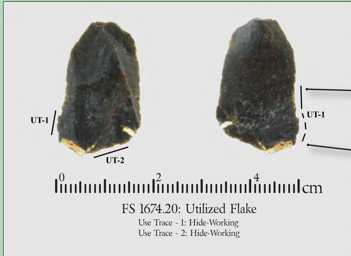
Location of microtraces on a stone tool, observed during microscopic analysis.