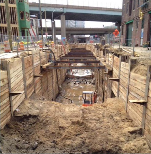
FIGURE 2. Construction activities for the Northern Liberties SFR Project showing an open cut installation of a box sewer.