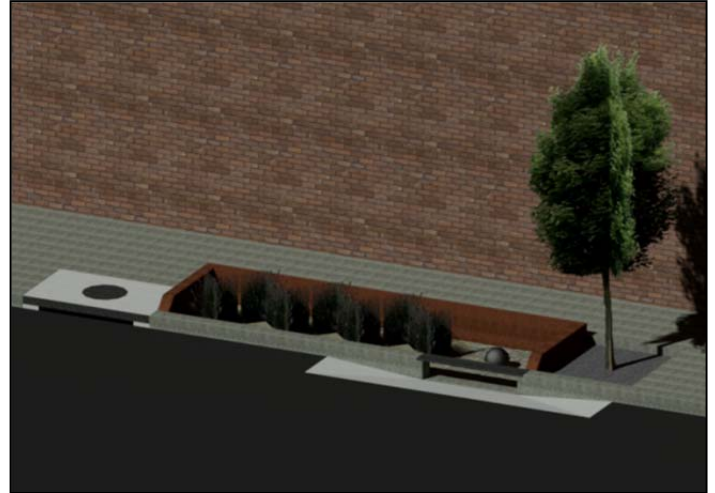
FIGURE 3. The Northern Liberties SFR Projects will have a Green Streets component. Recessed planter beds depicted above filter storm water from the roadway before being discharged to the Delaware River.