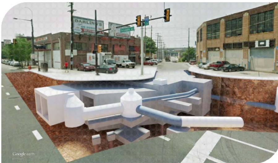
FIGURE 1. Rendering of completed PWD facilities beneath Laurel Street.

Coordination with SEPTA, PECO, PGW, and telecommunications companies, such as Verizon and Comcast, is ongoing during this work. This cooperative approach minimizes inconvenience and potential future service disruptions during construction.